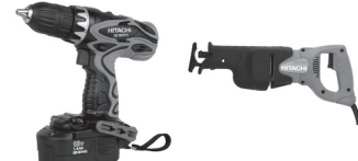
18V NiCd Drill DS18DVF3 10 Amp Recip Saw CR13V