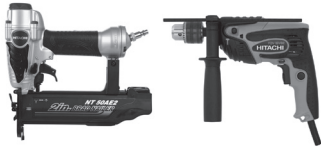
18 Ga Brad Nailer NT50AE2 5/8" Hammer Drill FDV16VB2