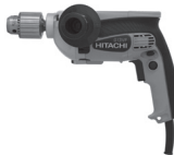
9.0 Amp, 1/2" Drill D13VF