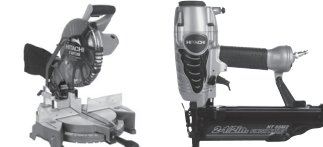
Miter Saw w/ Laser C10FCH2 16 Ga Finish Nailer NT65M2