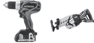
18V LI Driver Drill DS18DSAL Recip Saw with UVP CR13VBY