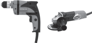
6.0 Amp, 3/8" Drill D10VH 4 1/2" Disk Grinder G12SR3