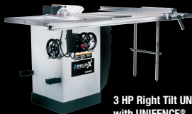
3 HP Right Tilt UNISAW® with UNIFENCE® Model 36-R31X-U50