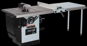
3 HP Left Tilt UNISAW ® with UNIFENCE ® Model 36-L31X-U50

From 1/1/07 to 5/31/07 buy any DELTA X5 ® UNISAW ® and get a $250 rebate by mail. See reverse side for more details.