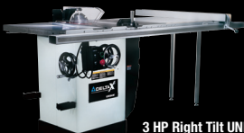
3 HP Right Tilt UNISAW® with BIESEMEYER® Fence Model 36-R31X-BC50