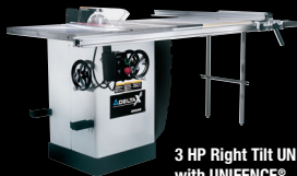
3 HP Right Tilt UNISAW ® with UNIFENCE ® Model 36-R31X-U50