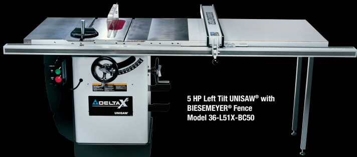
5 HP Left Tilt UNISAW ® with BIESEMEYER ® Fence Model 36-L51X-BC50