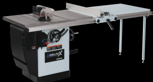
3 HP Left Tilt UNISAW® with UNIFENCE® Model 36-L31X-U50

From 1/1/07 to 5/31/07 buy any DELTA X5® UNISAW® and get a $250 rebate by mail. See reverse side for more details.