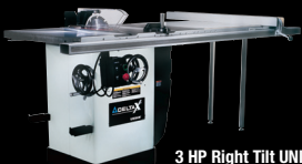
3 HP Right Tilt UNISAW ® with BIESEMEYER ® Fence Model 36-R31X-BC50